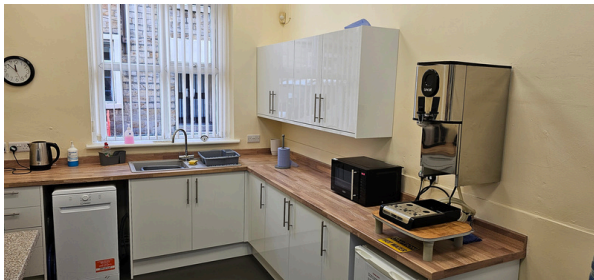
Ground floor kitchen facility