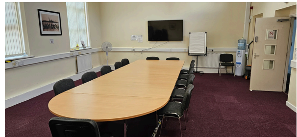
Conference Room (boardroom layout)