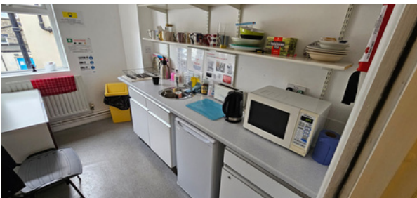
First floor kitchen facility