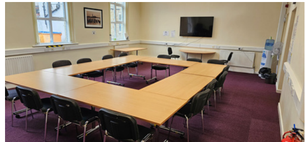
Conference Room (group meeting layout)