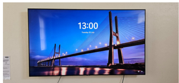
Large screen TV in the Conference Room