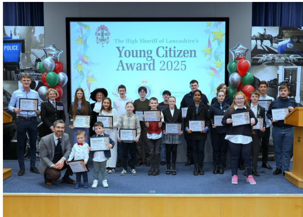
7 - Group Image