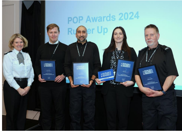
2 - Joint runner up submission - Operation Virage Plus