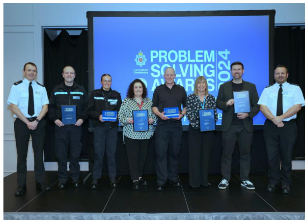
1 - Winning submission - Clear Hold Build