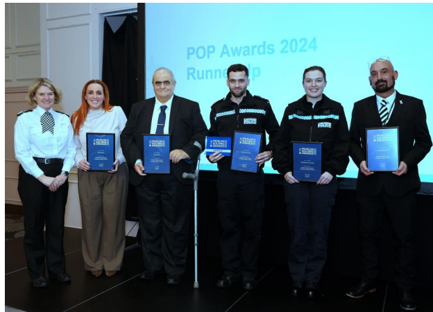
3 - Joint runner up submission - Blackpool Centurion